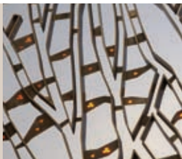
The bronze screen The pattern on the bronze screen symbolises pohutukawa and rata branches. The two trees are indigenous to New Zealand.

A bronze screen envelops the exterior of the new building. The forms were inspired by the intertwining of rata and pohutukawa trees. Red cut glass is set behind the bronze, representing the berries and flowers of both trees.