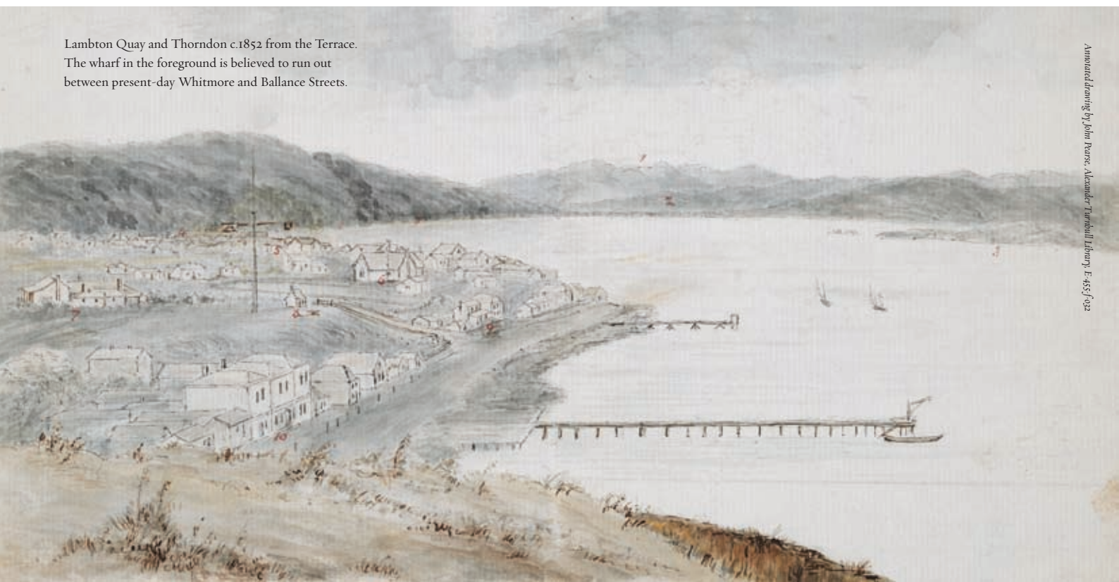
Lambton Quay and Thorndon c.1852 from the Terrace. The wharf in the foreground is believed to run out between present-day Whitmore and Ballance Streets.

Guided tours of the Supreme Court and the Old High Court Building are available. If you would like to find out more about the tours, please let us know. Email us: tours@justice.govt.nz