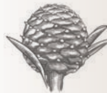
The kauri cone and the courtroom The new courtroom draws inspiration from the cone of a kauri tree. Its ovoid shape is made up of thousands of panels which mirror the texture of the cone.